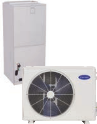
MODEL 38MURA HEAT PUMP with 40MUAA AIR HANDLER

Carrier was the first to offer systems with Puron® refrigerant, which does not contribute to ozone depletion. By replacing an older, less efficient horizontal heat pump with a Performance Series system, you could reduce your energy use and environmental impact.